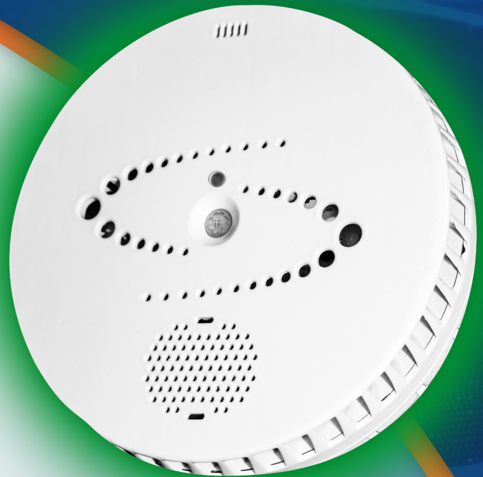
HALO Smart Sensor is Multi-Patented and Design is Trademarked

New security and environmental monitoring features provide users with even greater levels of security and easier installation. These features add to HALO's existing features of gunshot detection, noise alerts, and emergency keyword alerting.