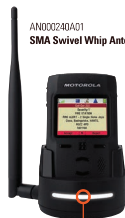
PMPN4142 Home Station